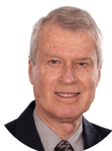
THE ORANGE COUNTY WATER DISTRICT

Revolutionised groundwater science and technologies, and developed a better scientific framework for policies and best practices globally