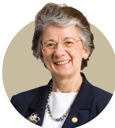
PROFESSOR RITA COLWELL, 2018 LAUREATE

Professor Rita Colwell was awarded the Prize for her pioneering insights into microbial water quality surveillance, and her pivotal contributions in translating these insights into concrete practices and policies to better manage waterborne diseases and protect public health. Professor Colwell was an early and active proponent of the use of novel molecular methods for more accurate and comprehensive diagnostics of water pathogens.