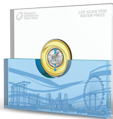
LEE KUAN YEW WATER PRIZE MEDALLION

The Lee Kuan Yew Water Prize 2020 laureate will receive S$300,000, a certificate, and a gold medallion at the award ceremony during the Singapore International Water Week 2020 to be held from 5 – 9 July, 2020.